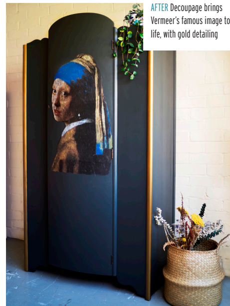
AFTER Decoupage brings Vermeer's famous image to life, with gold detailing

Over the years, I've tried a variety of brands and I now mainly use Autentico, Little Greene and Fired Earth, but have also recently tried Fusion and Vintage with Grace. When I do