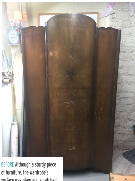
BEFORE Although a sturdy piece of furniture, the wardrobe's surface was plain and scratched

When I revamp an old piece of furniture, I feel great about extending its lifespan as well as keeping its heritage. I always wonder who the furniture once belonged to, where it travelled, what historic events it lived through. I love it when I find forgotten objects from the past when I clean the pieces. I recently found a copy of The Daily Telegraph from 1965 at the bottom of an old storage trunk, headlining news about the